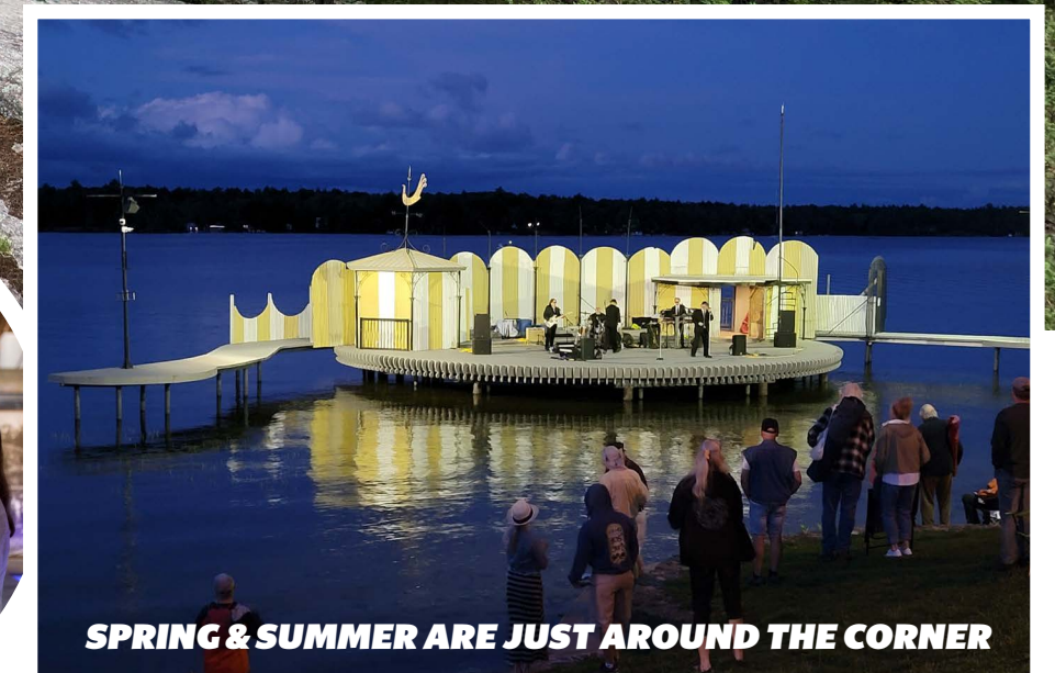
SPRING & SUMMER ARE JUST AROUND THE CORNER

Sound tempting? Book now and discover there is snow much more to Gravenhurst!