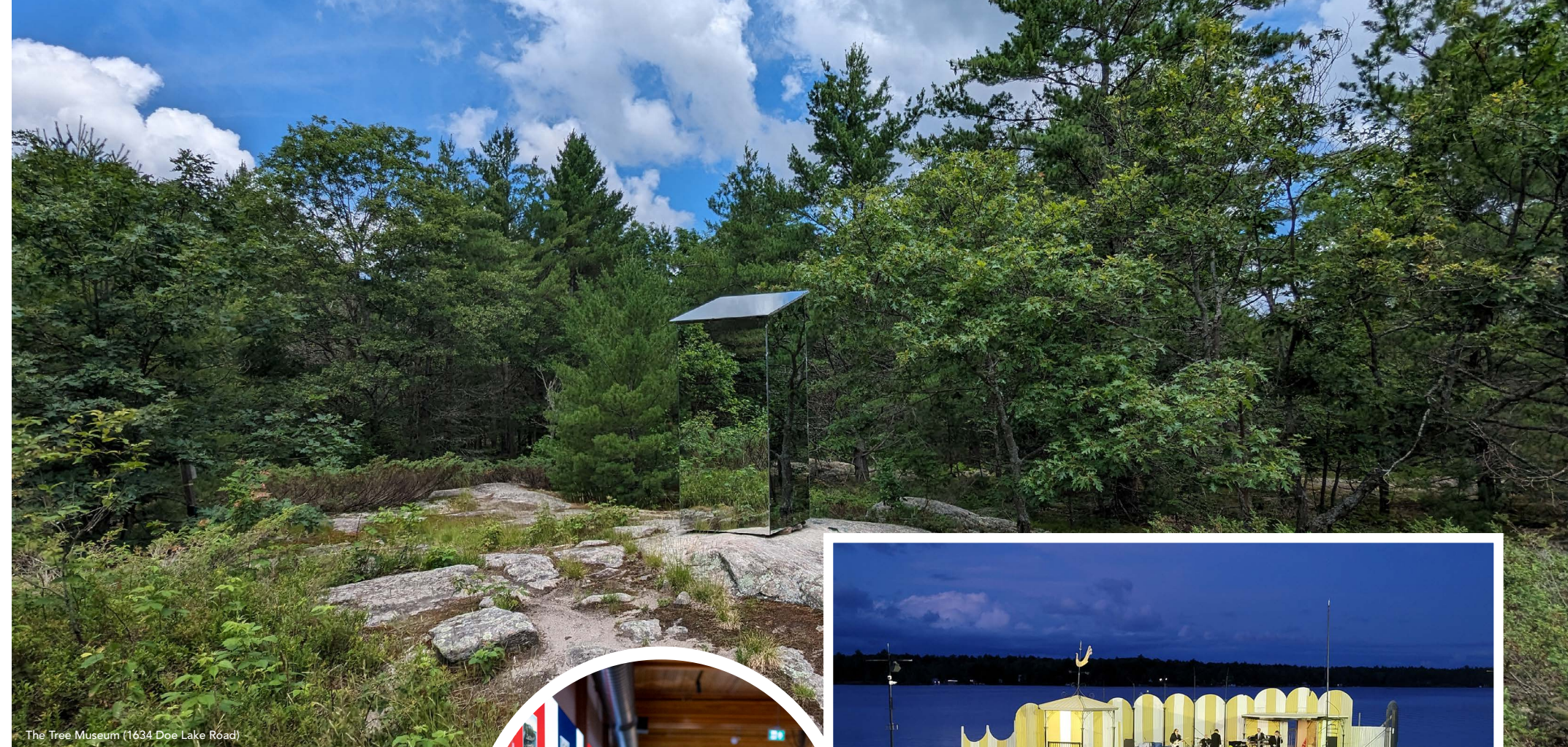
The Tree Museum (1634 Doe Lake Road)

Get the 'gram! Gravenhurst has photo ops everywhere you turn. Do you dream of rugged granite outcroppings, soaring pines, and lake vistas? We've got them! How about quirky art and giant Muskoka chairs? We've got those too! Start with the Peninsula Trail at the Muskoka Wharf, stop by the retro Gravenhurst sign, and spot influencers in the wild at the very cool Tree Museum .